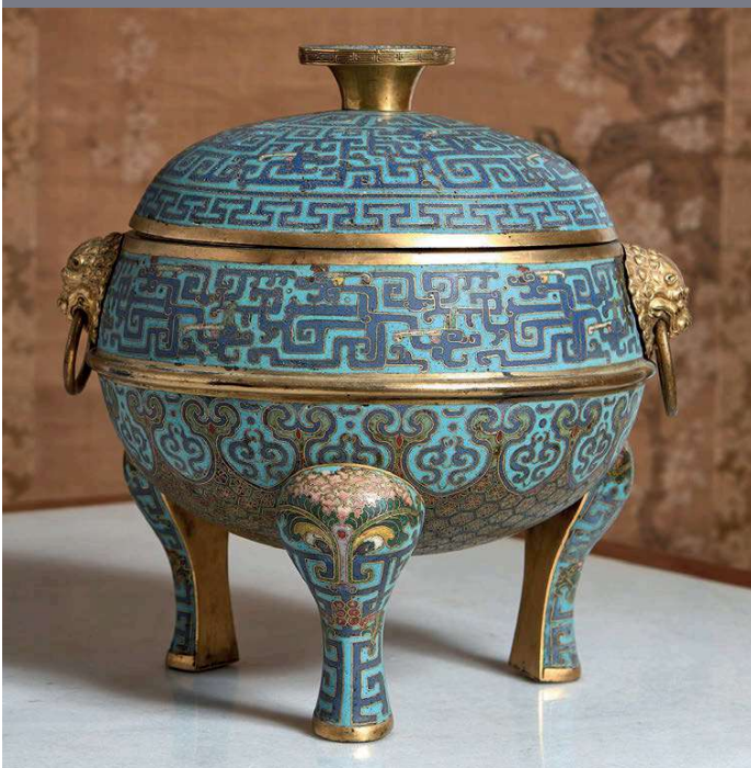
A rare Chinese Imperial archaic cloisonné enamel and gilt bronze ritual vessel, ding , Qianlong period Estimate: £6,000-8,000*

ROSEBERYS LONDON Fine Art Auctioneers & Valuers