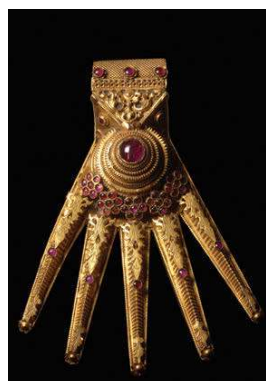
Gold tali pendant, Inset with rubies and red stone, part of a Kali Thiru (auspicious necklace), Chettiar Nattukottai, Tamil Nadu, South India, 19th century