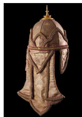
Court helmet, silver brocade intertwined with gold thread with gilt-copper finial in the form of a stupa, Thailand, bowl diam 20.5 cm, early 20th century, Runjeet Singh