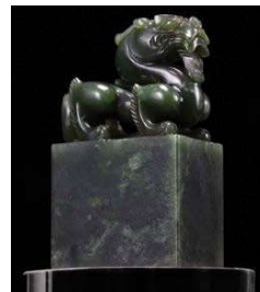
Imperial green jade 'De Sui Shu Xin' seal, Qing dynasty, Qianlong period, 1796, est €100,000-150,000, Sotheby's.