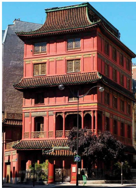
The Pagoda, near Parc Monceau, the former home and gallery of CT Loo

● The Pagoda, 48 rue de Courcelles, 75008, Paris, pagodaparis.com