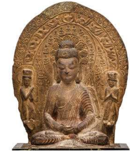
Carved stone Buddhist stele China, Northern Wei (386-534), height 40 cm, Gauchet Art Asiatique