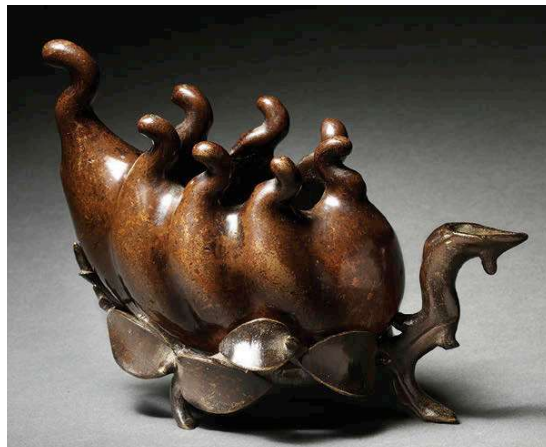
Incense burner in the form of a finger citron supported on a bronze branch with a rich gold splash patina, China, 17th/18th century, 20 x 15 cm, Brandt Asian Art