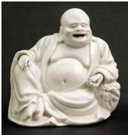
Figure of a smiling Buddha, enameled porcelain, China, 18th century, height 16 cm, Galerie Véronique Prévot.