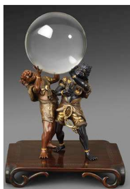
Inlaid shakudo and copper okimono of two oni by Sano Takachika, unsigned, height 18.5 cm, Meiji period, circa 1890, Malcolm Fairley