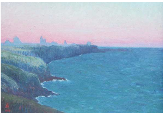
Port-Blanc Lighthouses (St-Lunaire), France, 1912, oil on canvas, 50 x 61 cm. Private collection

● Until 26 June, Art in Exile, Musée des Arts Asiatiques, Nice, arts-asiatiques.com