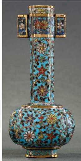
Arrow-vase (touhu), gilt-bronze and cloisonné enamels, China, Ming dynasty, 16th century, height 14 cm, Antiques Valérie Levesque