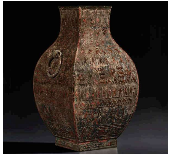
Inlaid bronze jar, fanghu , Warring States period, sold for US$2,760,000 (est US$400-600,000), at Christie's, New York, Important Chinese Ceramics and Works of Art on 24 and 25 March 2022

Over at Bonham's, a gilt-copper figure of Tara from Nepal, early Malla period, 13th-century, was the top lot across their auctions, achieving US$2.3 million, selling four times over estimate. Chinese works of art also sold well, with nine of the top 10 lots selling for multiples of their high estimates. The most contested lot was a pair of lemon-yellow glazed bowls with Yongzheng six-character marks, which sold for US$200,313, 40 times its pre-sale estimate (US$5-7,000). Chinese furniture brought strong bidding at Bonham's, too, with an 18th-century huanghuali Qin table, tiaoji , selling for US$212,813 against a pre-sale estimate of US$30-50,000.