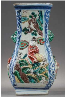
Vase, wucai porcelain, 16th century, first part of the Wanli period (1573-1620), height 17 cm, Galerie Bertrand de Lavergne