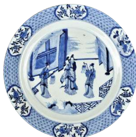
Large porcelain charger representing the imperial consort Lady Yang getting tipsy, China, Kangxi period (1662-1722), diam 35.8 cm, Galerie Nicolas Fournery