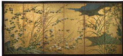
Six-panel screen with flowers, mostly morning-glory, gold leaf, colours on paper, Japan, middle Edo period, 165 x 372 cm, Galerie Captier