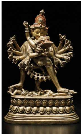
Brass figure of Kapaladhara Hevarja embracing his consort Nairatma from Northeast India, Pala period, 12th century, height 14.5 cm, est €120-160,000, Bonhams

circular box and cover from the 15th century, an important pair of zitan cabinets from the Qianlong reign, and a flambé-glazed vase with an impressed Qianlong mark and of the period and a green-ground famille-rose vase from the Daoguang period (r 1820-50). Also on offer is another selection of objects from the Galerie Douchange Collection,