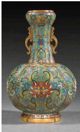
Cloisonné gilt-bronze vase, China, Qing dynasty, Qianlong mark and period (1736-1795), height 25.5 cm, est €20-30,000, Artcurial

Several auction houses are having sales in June. With Christie's and Adam's (Dublin) previewing June auctions with their sale on 6 June. The sale features works from private European collections spanning more than 3,000 years of Asian art. Featured are Ming- and Qing-dynasty porcelain from several private European collections, jade carvings, cloisonné enamels and lacquer, as well as classical and modern Chinese paintings. Highlights include an imperial cinnabar and ochre lacquer 'dragon'