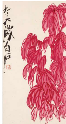
Red leaves by Qi Baishi (1864-1957), ink and colour on paper, signed, dated and with one seal of the artist, 66 x 33.8 cm, €40-60,000, Christie's

impressions at the right top corner of a painting or piece of calligraphy. The Desui chuxin (Able to Follow My Original Intention) seal was a very important seal during the time of Emperor Qianlong's retirement, since it means 'that he now has fulfilled his heart's desire, which he had had from the very beginning of his life'. The seal revealed his enormous satisfaction that family and national matters were progressing just as he had planned from the very beginning.