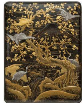
Ryoshibako (document box), in takamaki-e and hiramaki-e gold and silver lacquer, gold leaf and kirigane, on black background, Japan. Edo period, 16 x 40 x 30.5 cm, Galerie Tiago