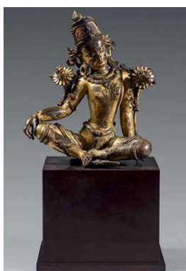
Indra, gilded copper, Kathmandu Valley, Nepal, 15th century, end of Malla period (1200-1482), height 17 cm, Galerie Hioco.