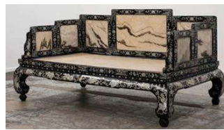
Black lacquer luohan bed with inlaid with mother-of-pearl, armrests and backrest adorned with Dali marble slabs, Qing dynasty (1644-1911), late 18th century China, 220 x 124 x 110.5 cm, Galerie Luohan