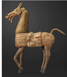
Figure of a horse, wood with traces of polychrome, Wuwei Province, China, Han dynasty (BC 206-AD 220), 107 x 83 cm, Galerie Jacques Barrère