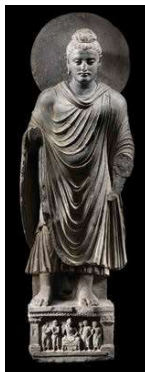
Grey schist Buddha, Gandhara, 3rd century, est €500-700,000, Bonhams

Several auction houses are having sales in June. With Christie's and Adam's (Dublin) previewing June auctions with their sale on 6 June. The sale features works from private European collections spanning more than 3,000 years of Asian art. Featured are Ming- and Qing-dynasty porcelain from several private European collections, jade carvings, cloisonné enamels and lacquer, as well as classical and modern Chinese paintings. Highlights include an imperial cinnabar and ochre lacquer 'dragon'