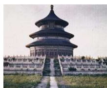
Temple of Heaven, Peking, 1913, Stéphane Passet, autochrome, 9 x 12 cm

The inaugural exhibition, Around the World , takes visitors on a journey to the origins of the Archives de la Planète, offering a tour of the museum's collections and an exploration of representations of travel