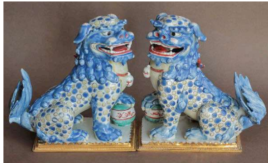
Pair of porcelain Shishi, Arita, Japan, Edo period, circa 1670-90, JM Béalu & Fils