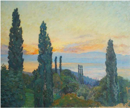
Untitled, Algeria, circa 1916, oil on canvas, 54 x 65 cm. Private collection