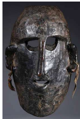
Tribal mask, wood with soot patina, south central Nepal, Indian Heritage